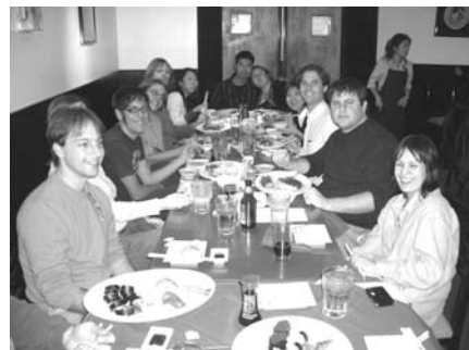
The RMJETAA sponsored JET Alum, friends and family in Denver at Mori's Sushi Restaurant for dinner and karaoke!