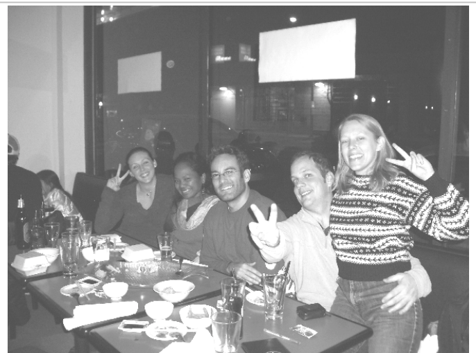
The New Mexican JET Alumni enjoy their annual reunion and some sushi at Crazy Fish.